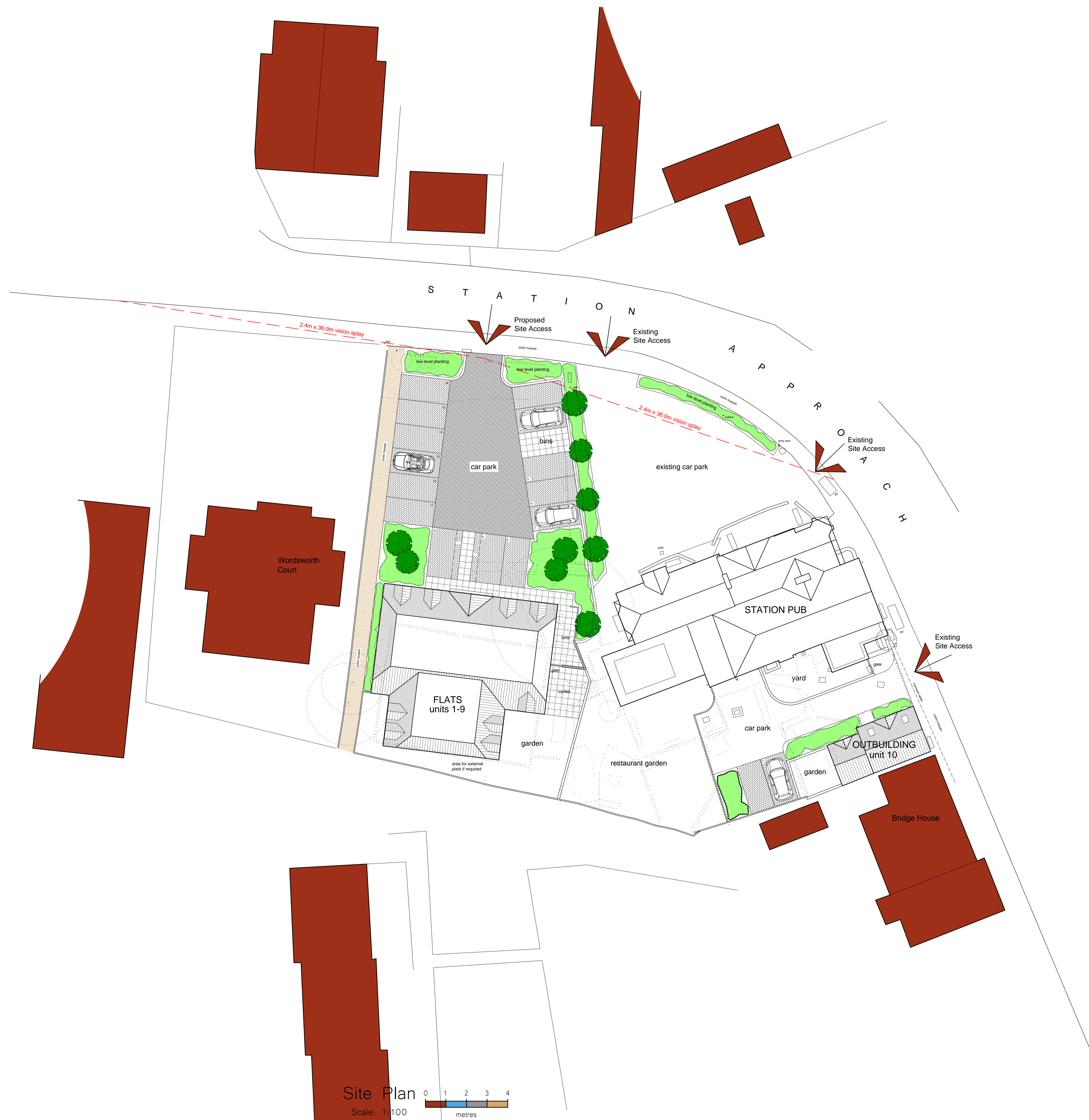
Site Plan Scale: 1:100