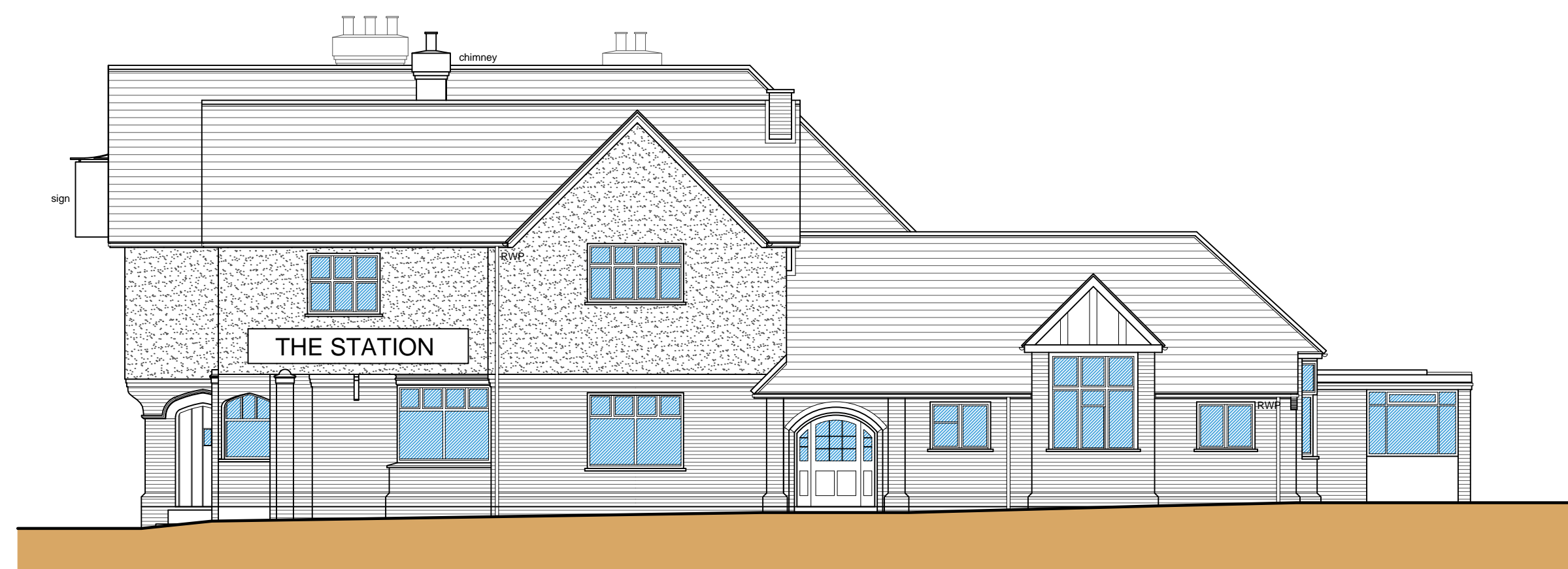
Front Elevation (NW) 0 1 2 3 4 Scale: 1:100 metres