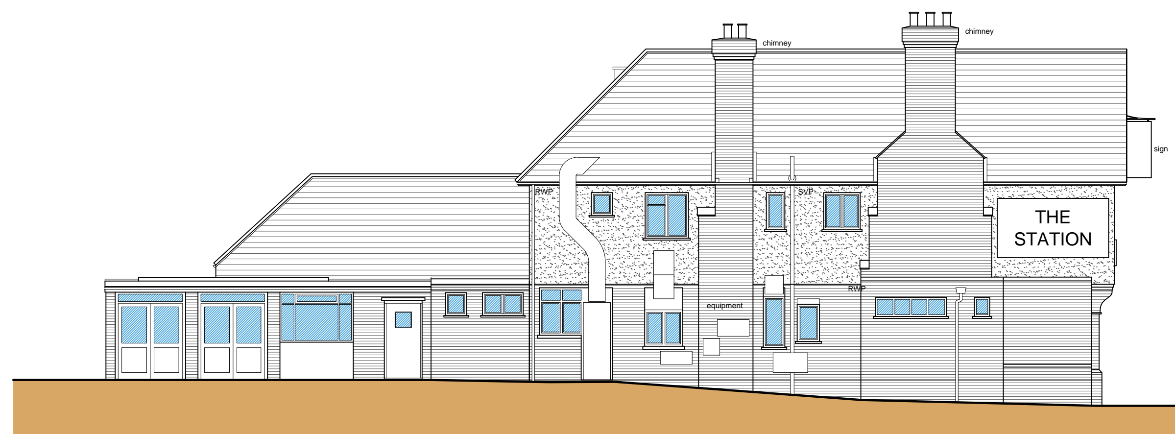
Rear Elevation (SE) 0 1 2 3 4 Scale: 1:100 metres