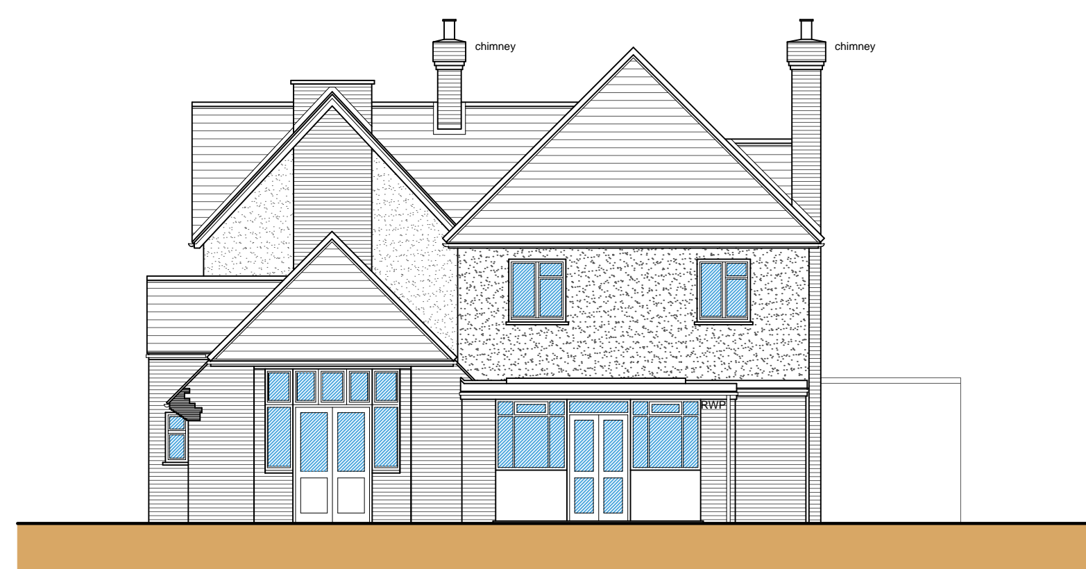
Side Elevation (SW) 0 1 2 3 4 Scale: 1:100 metres