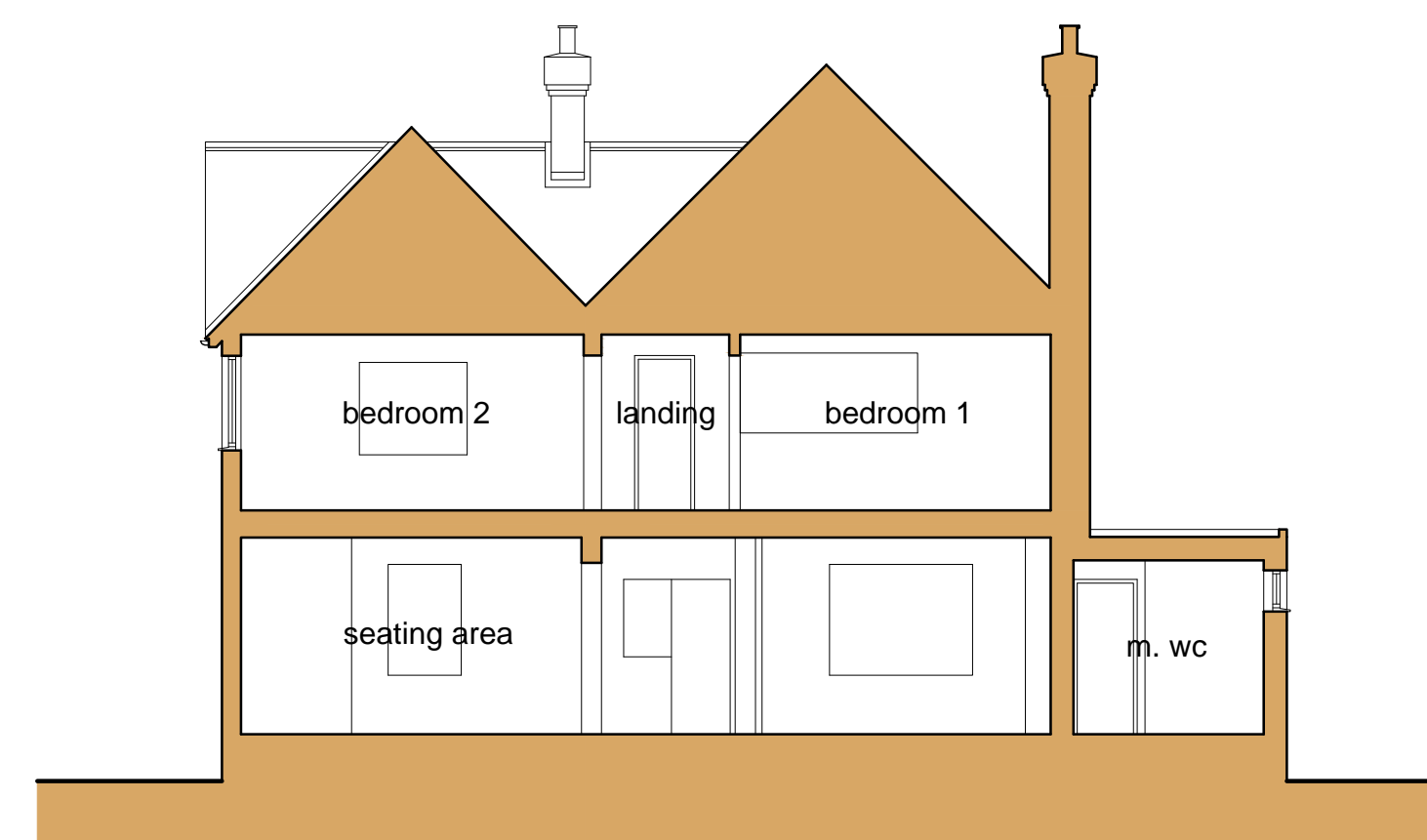
Section C-C 0 1 2 3 4 Scale: 1:100 metres