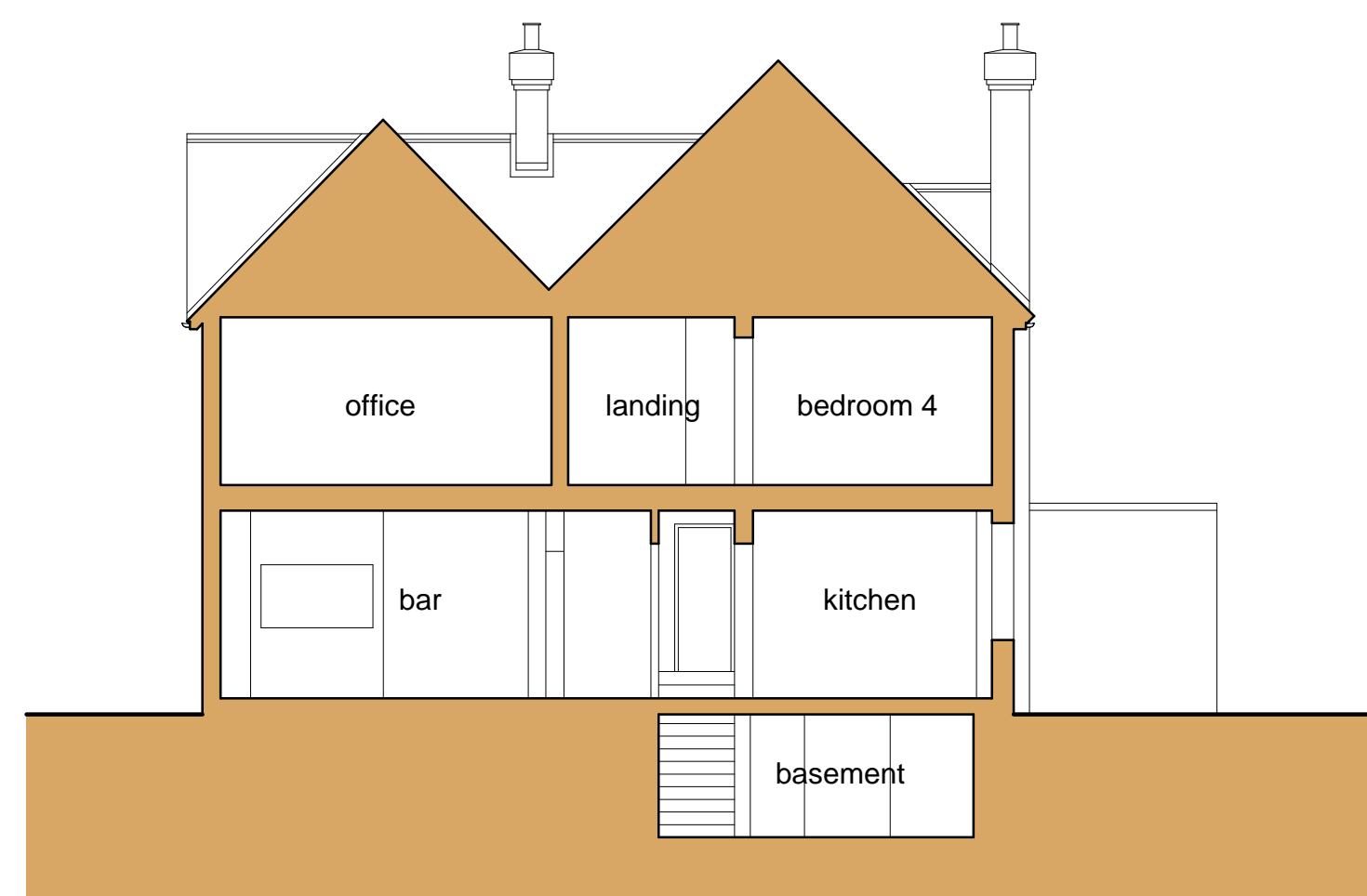
Section B-B 0 1 2 3 4 Scale: 1:100 metres