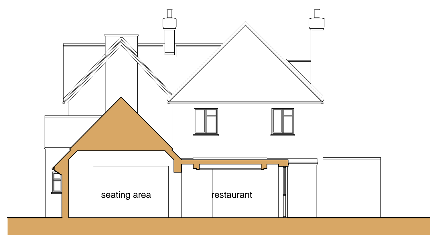
Section A-A 0 1 2 3 4 Scale: 1:100 metres